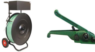
Strapping - installation & storage tooling